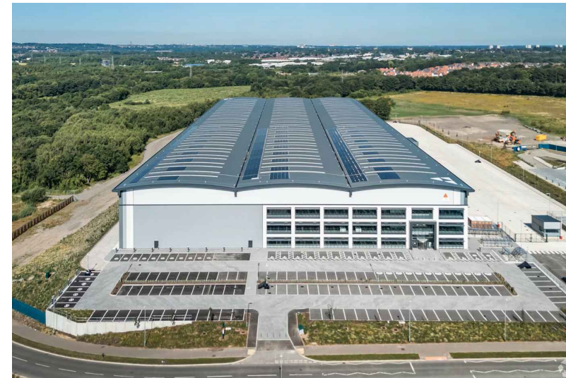
Image 2 - Aerial view of Symmetry Park, Merseyside