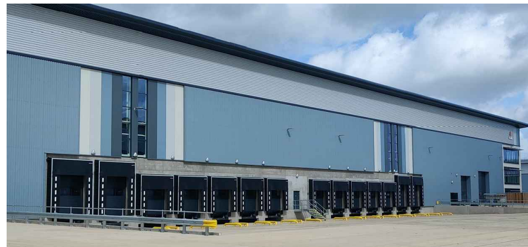
Image 4 - Symmetry Park, Biggleswade