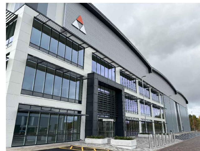
Image 7 - Symmetry Park, Biggleswade