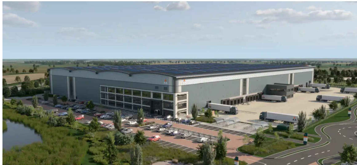
Image 1 - Artists Impression of typical Tritax Big Box Logistics Facility