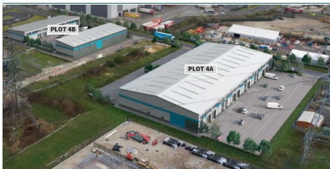
Exchanged contracts for the disposal of an 83,000 sq ft terraced warehousing scheme at Littlebrook, Dartford, for £25m.