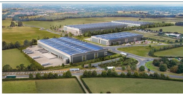
Iron Mountain: 5 units (2 pre-let, 3 spec let during construction) of 1.3 m sq ft.